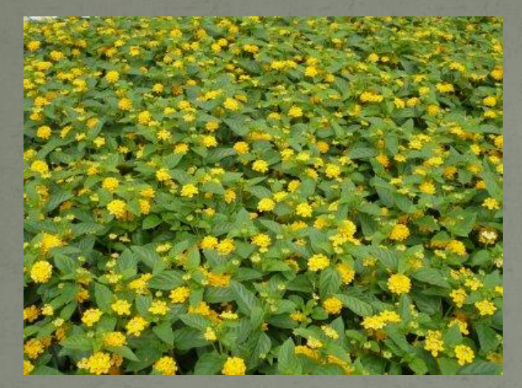
Lucky Pot of Gold

Compact, mounding type lantana: Grows 12-16" H and 12-14" W