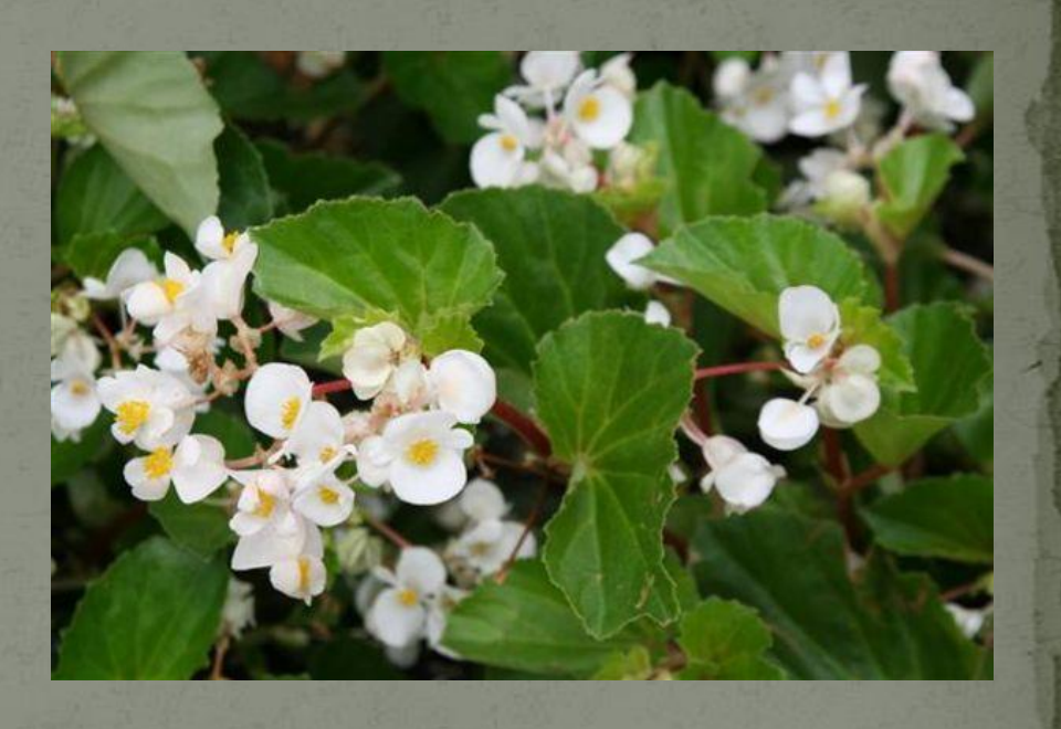
Baby Wing White Begonia