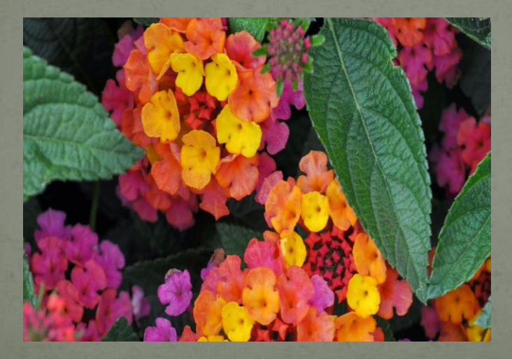
Lucky Sunrise Rose