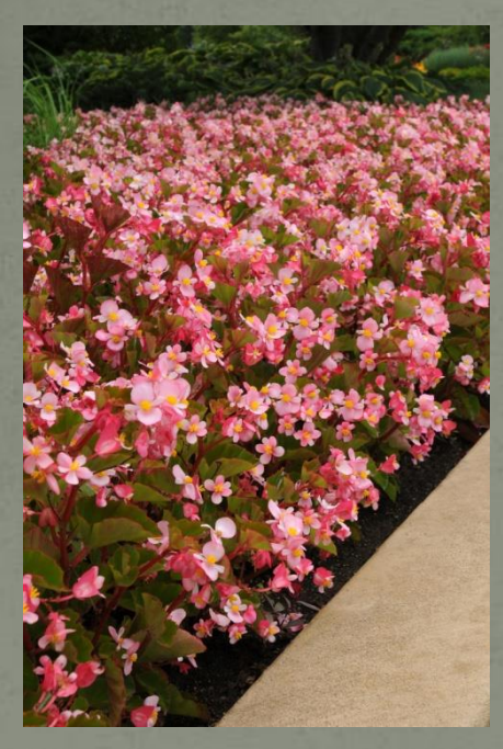
Baby Wing Pink Begonia

Upright mounded plant Sun or Shade (prefers filtered sun) 12-15" H 10-12" W