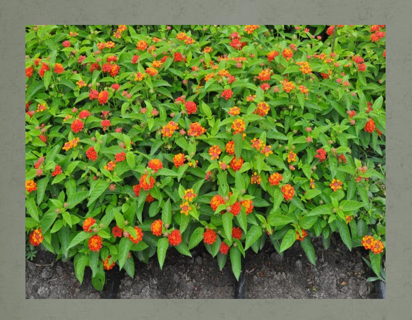
Little Lucky Red

Shorter and more compact: Grows 12-16" H and 12-14" W