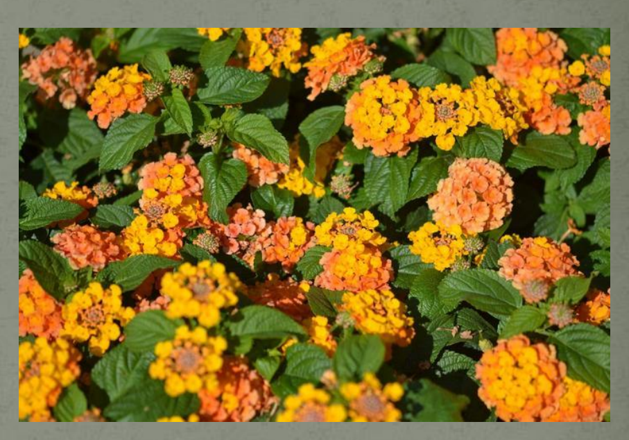
Little Lucky Orange